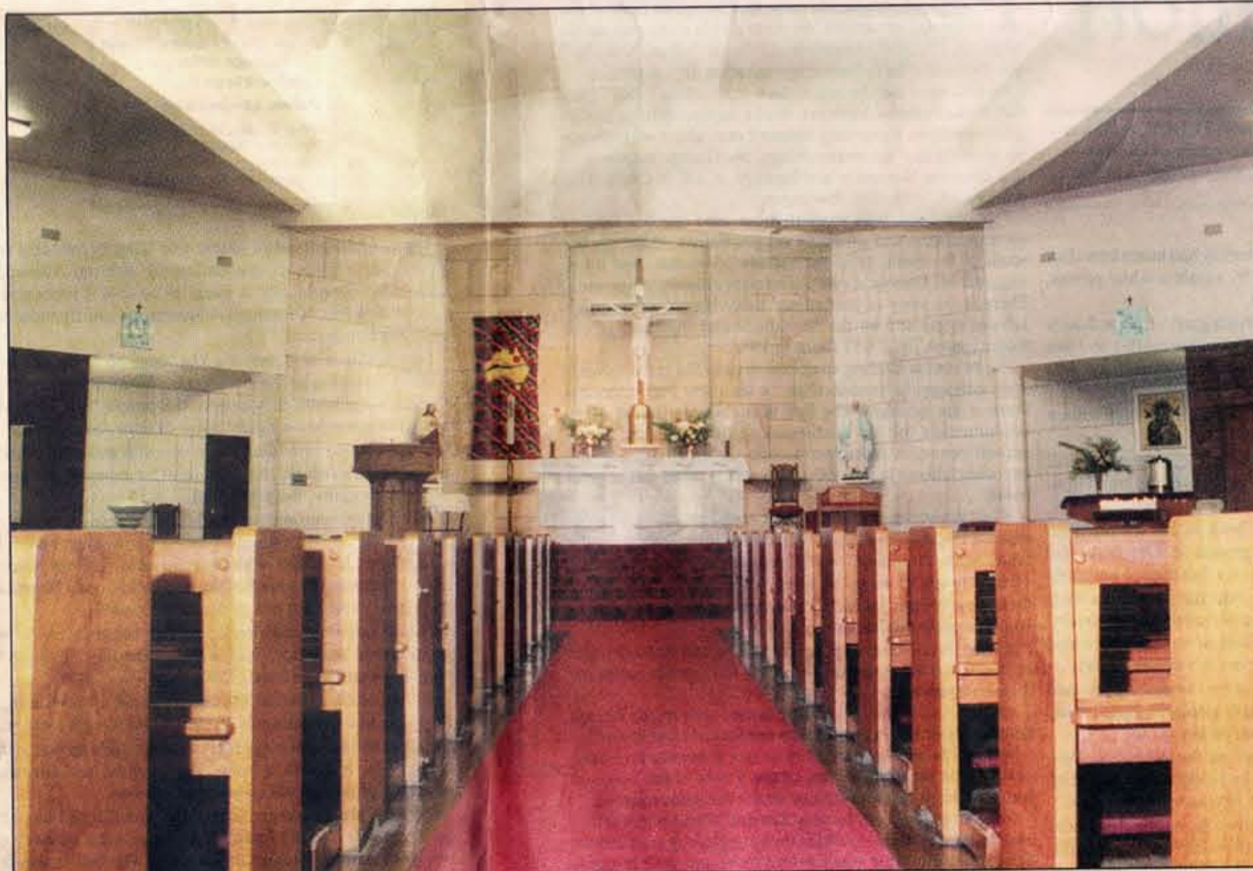
The crucifix, the altar, the statues of the Sacred Heart and Mary, and the tabernacle are important to the parish because they provide a link with the past. The colourful banner shows Australia in a way to remind parishioners that it is our country regardless of their cultural background. St Dominic's was the first auditorium style church in Sydney. There are no pillars and all seats give a good view of the sanctuary. To the right, Mary of Perpetual Succour has been a devotion in the parish since 1960. The pews are original and the church seats 400, with another 50 in the loft.