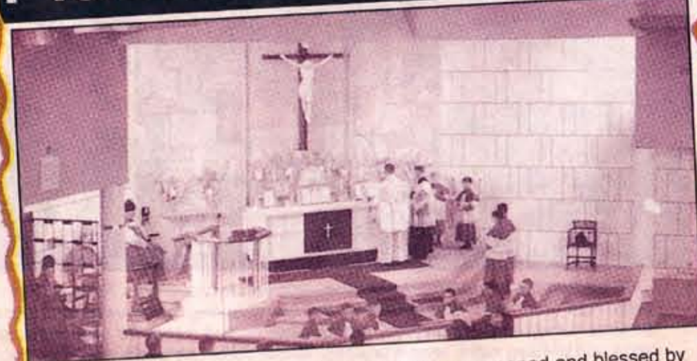
How the sanctuary looked when the church was opened and blessed by Cardinal Gilroy in 1956. This picture shows the contrast with the sanctuary of today.